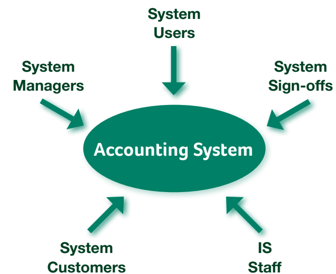
Multiple groups should have input into the software selection process.

There are, in general, five groups of people who should be involved in the selection process: